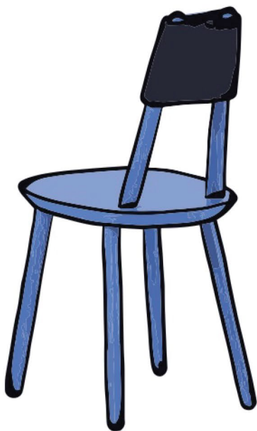
Naïve chair design by etc.etc.